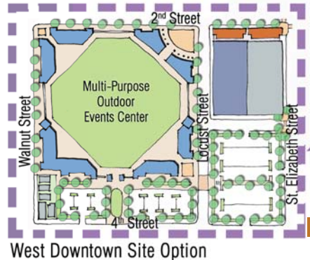
West Downtown Site Option

A Transformation of Veterans Blvd. Veterans Blvd. will be reinvented to be a pedestrian priority street with specialty paving, flat curbs, on-street parking, and streetscape amenities. Infill buildings on Veterans Blvd. will be 3-4 story mixed use buildings with active retail and restaurant uses on the ground floor and residential uses above. Veterans Blvd. will be a linear plaza connecting the RiverPark Center to the new hotel and Indoor Events Center.